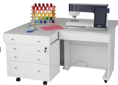
Kangaroo & Joey II Sewing Cabinet

Sewing cabinets provide comfort, easy set-up and dedicated storage for your machine and notions. They produce an enjoyable, ergonomic sewing experience and create a spirited environment for sewing and crafting! Your machine deserves better than the dining room table, and so do you! Sew in comfort and sew longer with Kangaroo's sewing cabinets!